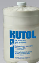
Flat Gallon 6207