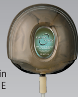
2 L Duraview 6267