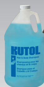
Pour Gallon 7509