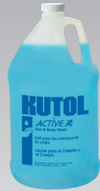
Pour Gallon 7609

Choose from Active Hair & Body Wash or Hair & Body Shampoo - both effective cleaners