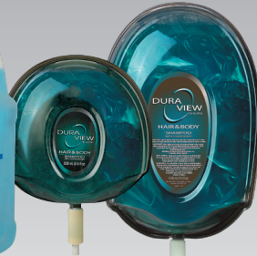
2 L Duraview 7567